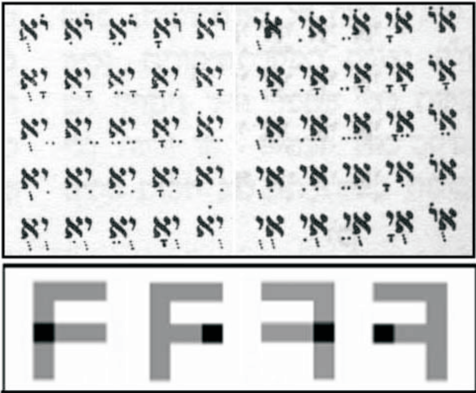
Figure 2. Letters tasks

Figure 2a. Abulafia's letter combinations task: Combinations of pairs of letters and vowels ( \aleph = A ; \daleth = y ) before and after transformations. The signs underneath and above the letters are the vowels, which indicate different expression of each pair. See Idel (1988) for further details.